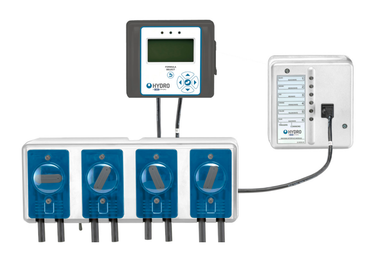
Shown with Total Eclipse Controller and Machine Interface

The standard LM-200 pumps have a reference output of 12 oz./min.