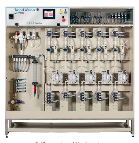
5-Channel Tunnel Confirguration Model Numbers: HYDSPD0035 (US), HYDSPD0035M (Metric)